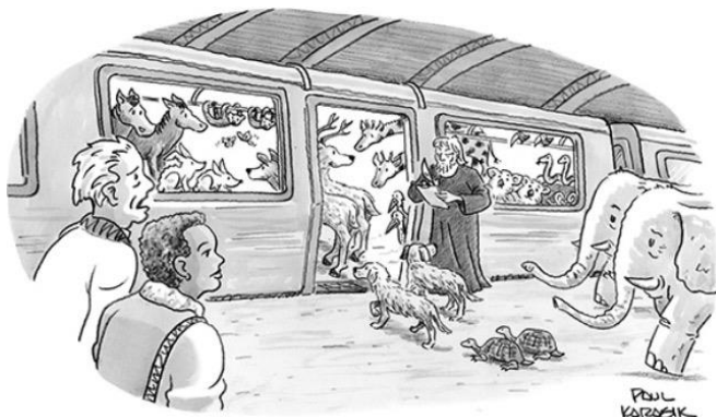
"I don't care if it's the local or the express. We're getting on board."

*From The Book of Discipline of The United Methodist Church- 2016. Copyright 2016 by The United Methodist Publishing House. To see both first and second segment: https://www.umc.org/en/content/the-general-rules-of-the-methodist-church