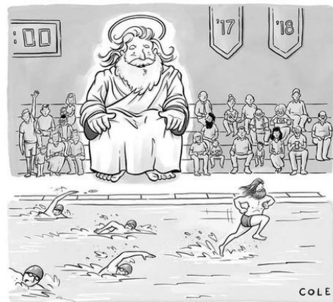
"That's my boy!"