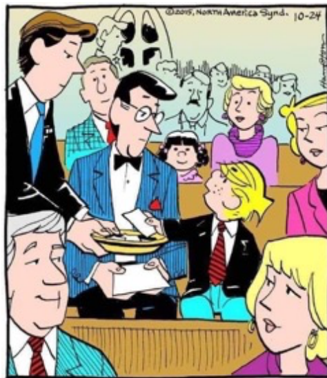
"CAN WE GET A REFUND IF THE SERMON ISN'T THAT GOOD?"