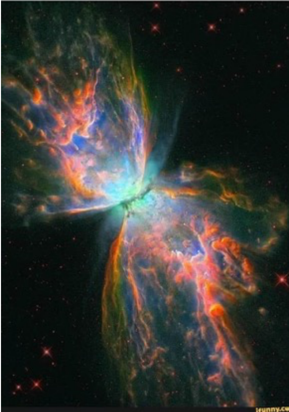
"Stunning! The 'Butterfly Nebula' as captured by Hubble

[Editor's note: When reading articles such as this, one can only exclaim, "How big is God!"]