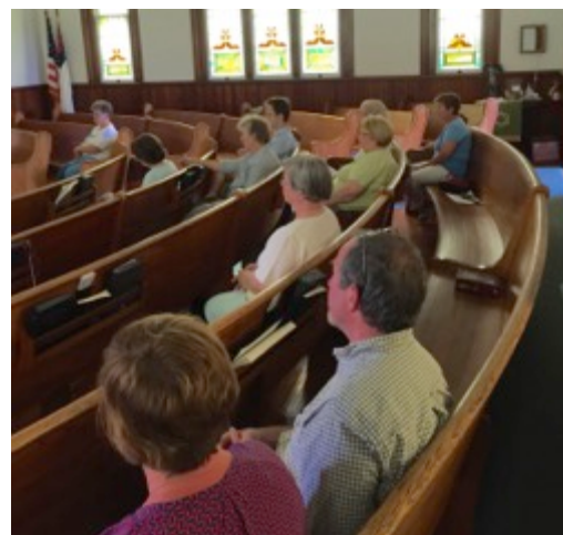
On June 14, a small, but appreciative, crowd heard presenters from the hospital, hospice, and health department share resources for "Caring for the Caregiver." Thanks to the Nursing Ministry team.