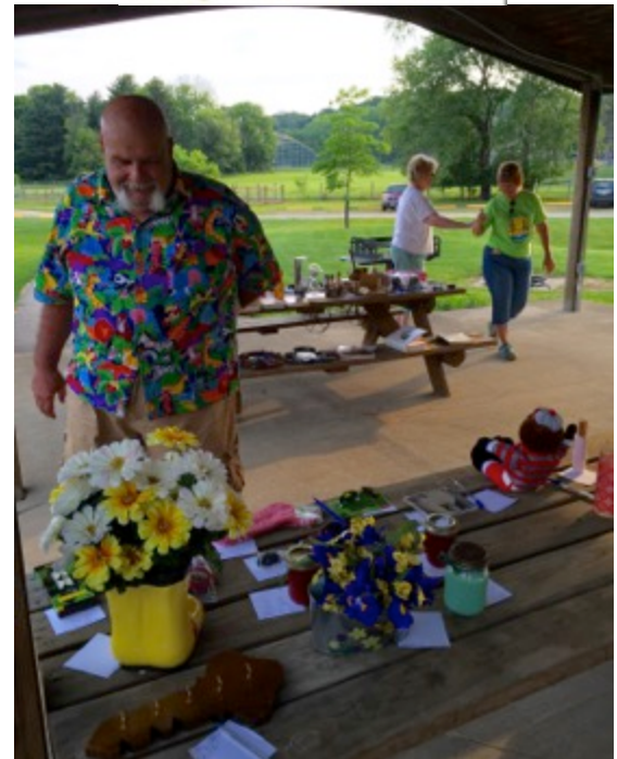
About 30 picnickers enjoyed the food, fellowship, silent auction bidding, and warm weather at the Gambier Park shelter house on June 11. Thanks to UMW for sponsoring the picnic.