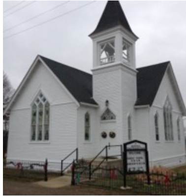
HUCM, before and after re-painting in November.