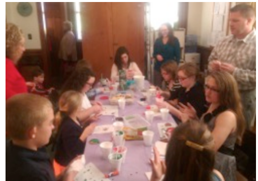
Dec. 7 – After worship, HUCM youth decorated cookies as a gift for others.