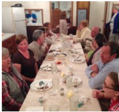
Nov. 12 – Thirty-two members and friends enjoyed the food and fellowship during the annual, UMW-sponsored church family dinner at the Mullet restaurant on Deal Road. Very little remained but the dirty dishes.