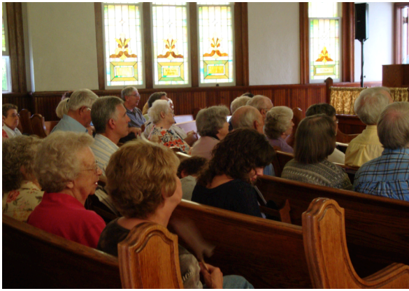
Members and friends at the Scioto Ridge Boys concert on 6/9