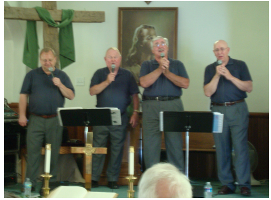
The Scioto Ridge Boys love singing in "This Old House"