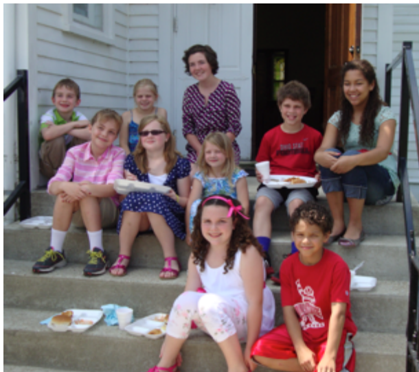
Hopewell children enjoy the potluck lunch on 6/23.