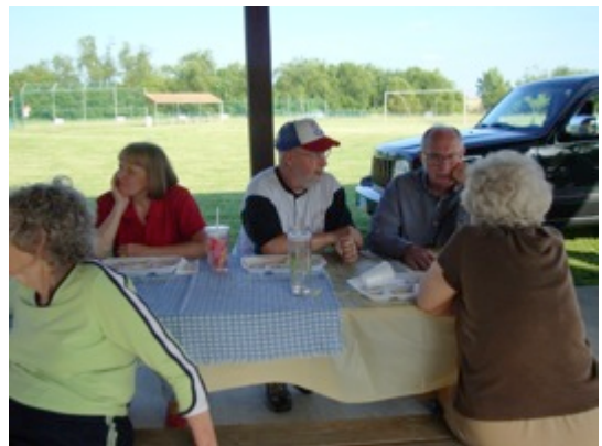
Picnickers enjoy food and fellowship at Gambier Community Park on 6/11