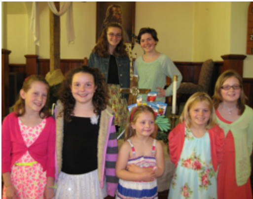
Earth Sunday Spring Beauties at Hopewell UMC