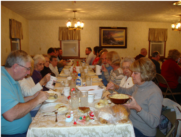
24 members and guests from Hopewell UMC enjoyed dinner at Mullet's on November 13.