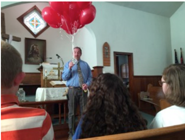
God wants to lift the weight that burdens us. (Children’s moment, 4/12)