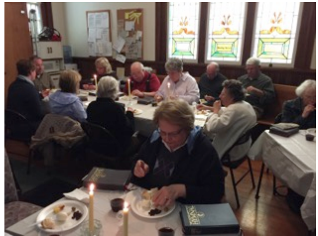
On Maundy Thursday, 19 people gathered for a ‘love feast’ (above). Each item was a reminder of the simple foods the early Christians might have shared (below).