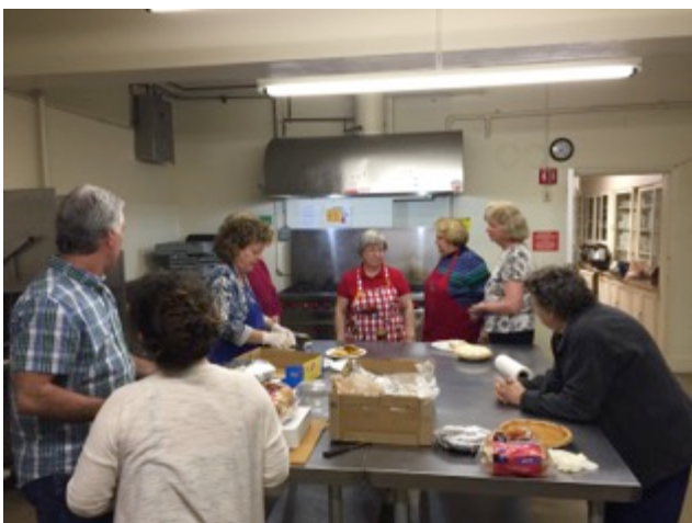
At the CES Credit Union dinner on 4/13, more than 20 HUMC workers served over 300 people in less than 2 hours. Several relaxed after kitchen cleanup (above).