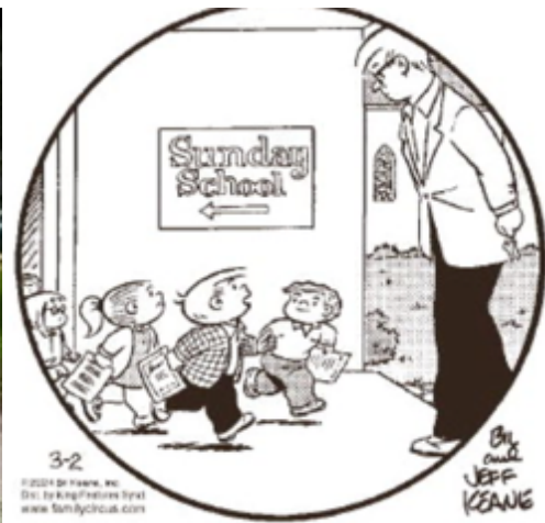
"Today we learned about the Top Ten Commandments."