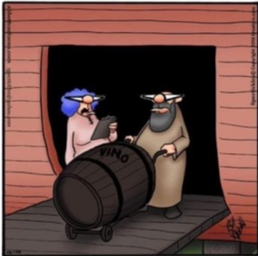
"It's either another barrel of wine or the unicorns, Noah. There isn't enough room for both, so choose wisely."

© 1987 FunWorks, Inc. All rights reserved.