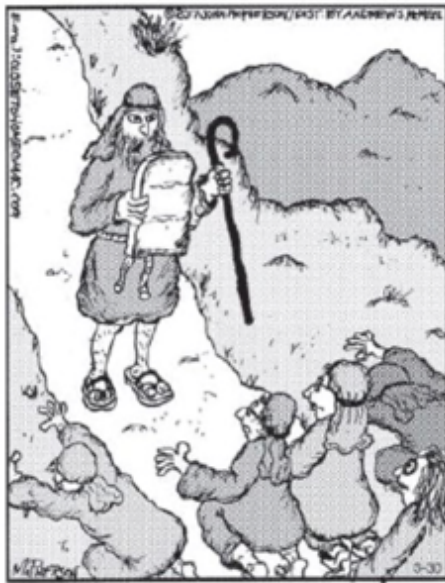
"Chill out. This is just my shopping list."