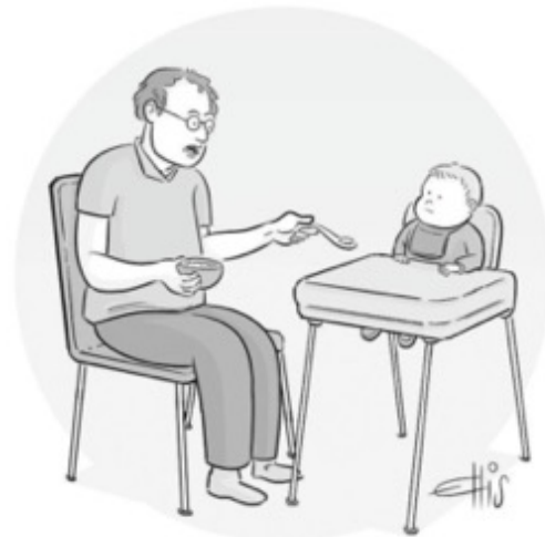
"After I introduce you to solids, I'm going to need your help with some computer stuff."